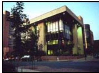
The School of Continuing Education and Academic Outreach, Downtown Fayetteville 2 East Center Street Fayetteville, Arkansas 72701